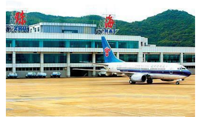
Figure 7: Zhuhai Airport

Air: Zhuhai has one international airport, the Zhuhai Jinwan Airport. The Jinwan Airport is located at the southwest tip of Sanzao Island in west Zhuhai and 31km from the urban area. The airport offers direct flights to and from more than 20 cities, for example Beijing, Shanghai, Chengdu or Guilin. It also needs just 1h to the HK airport and 45min to the Macao airport.