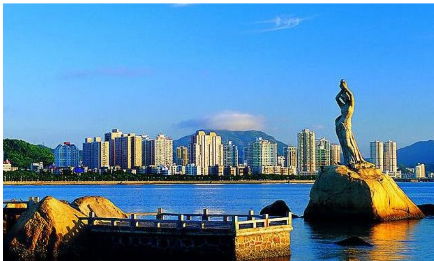
Figure 2: Zhuhai Fisher Girl

One of the big advantages of Zhuhai is the transit hub. The location of Zhuhai makes it convenient to get to important industrial and economic locations. For example: Hong Kong, Guangzhou, Dongguan or Shenzhen. 1