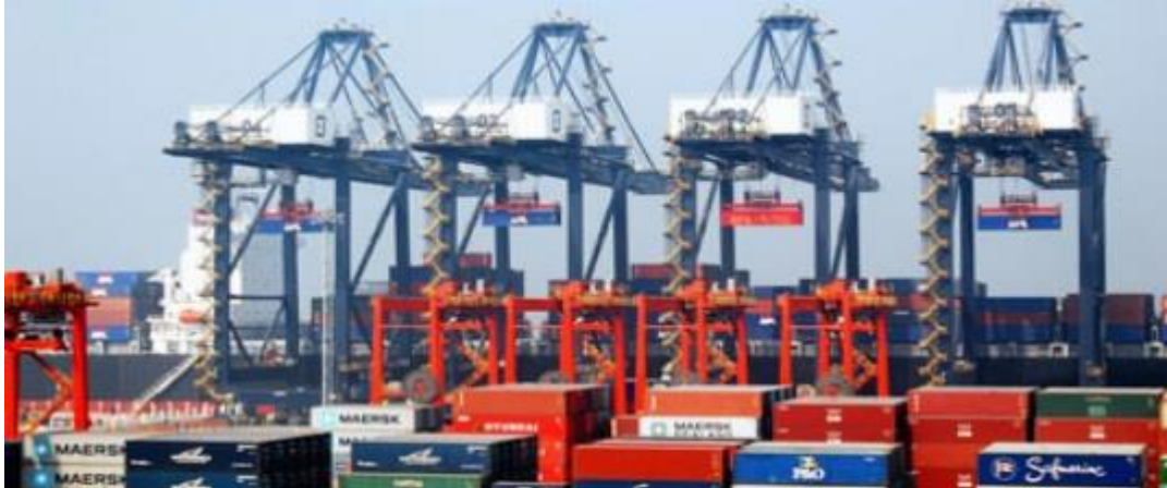
Figure 6: Gaolan Port

Zhuhai has a perfect transportation network and a quite convenient external access. There are four different ways to ship and transport goods and passengers to Zhuhai or to other cities and regions: