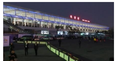
Figure 9: Zhuhai Railway Station

Railway: The Zhuhai Railway Station also called Gongbei Station is next to the Gongbei Port of Entry. The railway station has a direct high speed connection to Guangzhou.