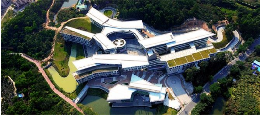
Figure 11: United International College founded by Beijing Normal University and Hong Kong Baptist University

In the late 20th century the city of Zhuhai decided to enhance the strength of Zhuhai as a Special Economic Zone by building a University Park and a Technical Innovation Beach. Today, there are more than 17 institutions of higher learning and research. Some of them also established bases for production. The local government took major initiatives and aims for an university park with an area of 20 square kilometres. These are some of the universities in and around Zhuhai: