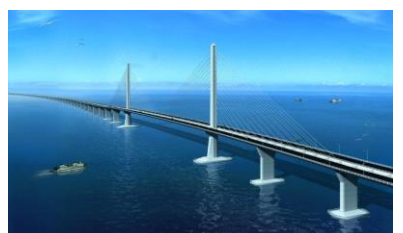
Figure 10: Future Zhuhai-Macau-Hong Kong Bridge

Road: The Zhuhai highway system radiates from the inside outward to nearby counties and towns. This traffic network connects major towns, ports and the airport. In 2016, the bridge which connects Zhuhai, Macau and Hong Kong will be completed. It will be possible to get from Zhuhai to Hong Kong in half an hour. 4