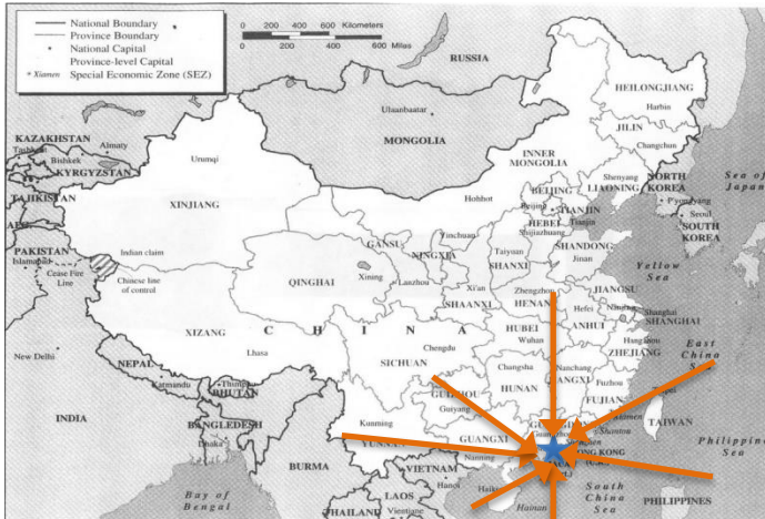
Figure 3: Shipment to the FTZ