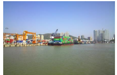
Figure 8: The Port of Zhuhai

Sea: The Port of Zhuhai has seven main port areas, Gaolan, Wanshan, Jiuzhou, Xiangzhou, Tangjia, Hongwan and Doumen. The main areas are the Jiujiang Port Area at the east coast and the Gaolang Port Area at the west coast. Both ports have more than 131 berths and 161 production berths, of which are 17 were deep-water berths over 10,000DWT. The ports have a cargo throughput of more than 100 Million tonnes every year. Furthermore the Jiuzhou Port Area has a container terminal and a high-speed ferry connection to the Pearl River Delta. It provides a convenient direct connection the Port of Hong Kong, one of the busiest ports in the world.